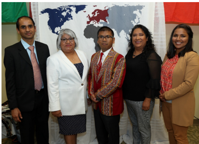
2022 Passport to Prosperity Honorees