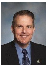
Senator Daryl Beall State Senator District 25